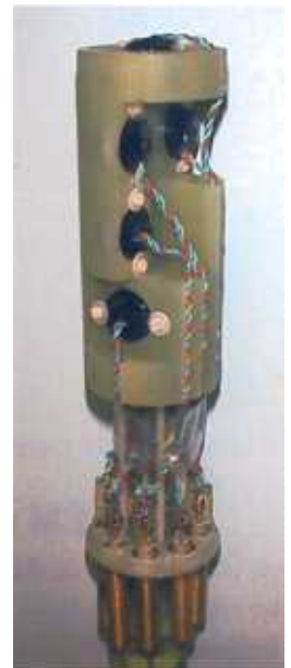
T877 sensor housing showing cold electronics

For airborne operation, Tristan can supply custom dewars including horizontal or other customer specified configurations.